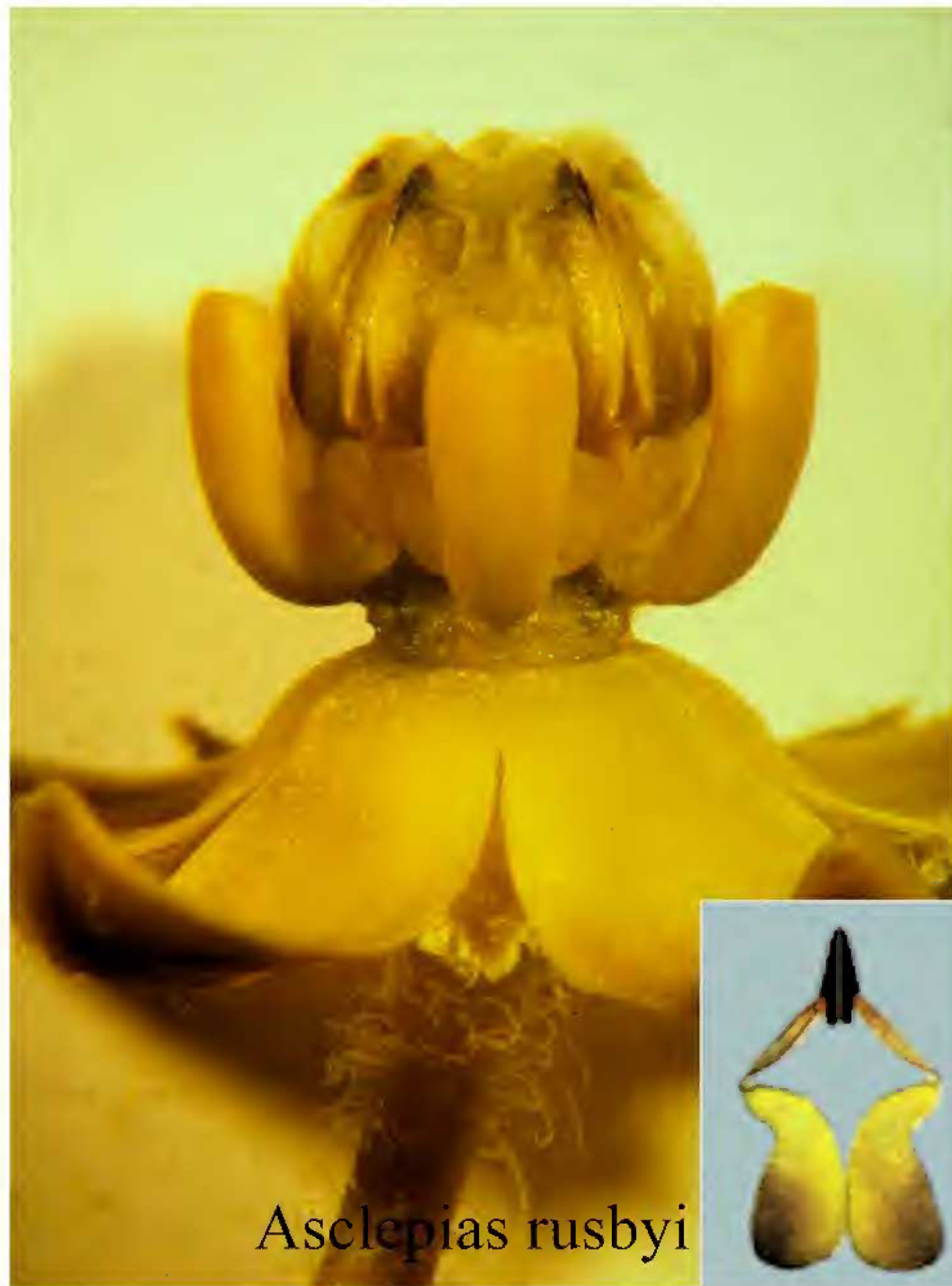
Figure 3. Asclepias rusbyi flower from Navajo Co., AZ. Inset shows the pollinarium.